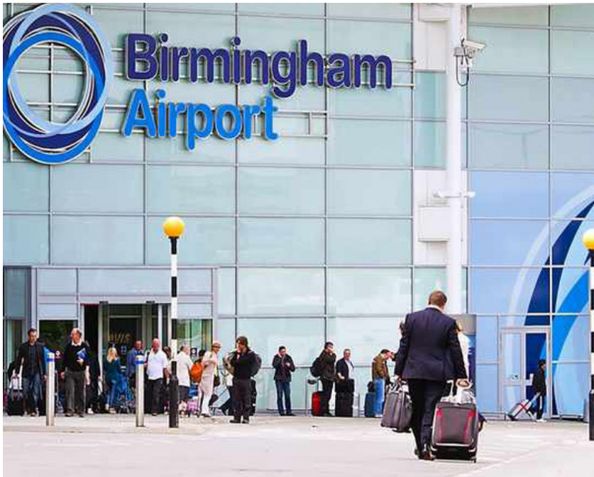
Birmingham Airport BHX From Venue & primary hotel 101 mins | 154km