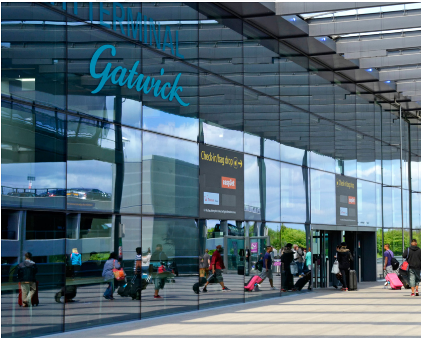
Gatwick Airport LGW From Venue & primary hotel 155 mins | 238km