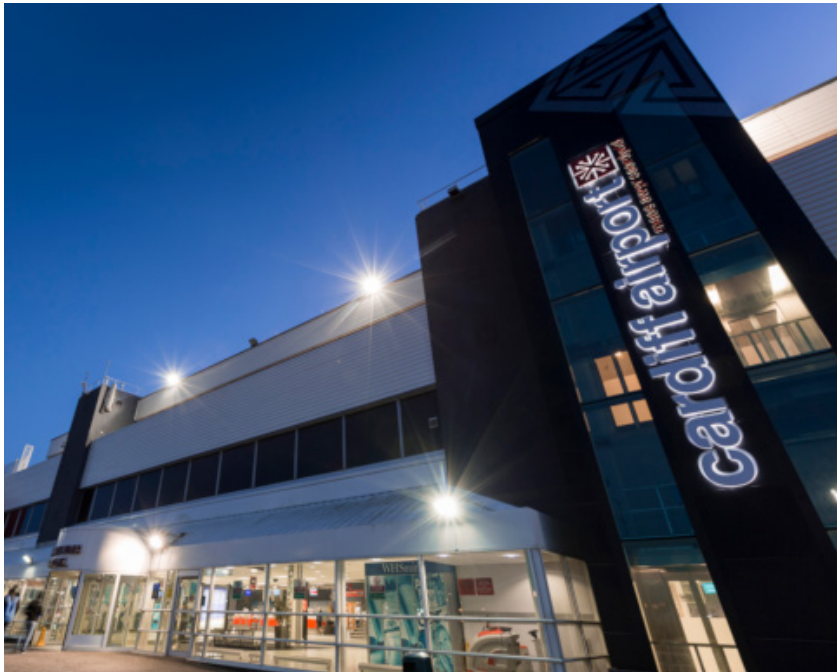
Cardiff Airport CWL From Venue & primary hotel 42 mins | 48km