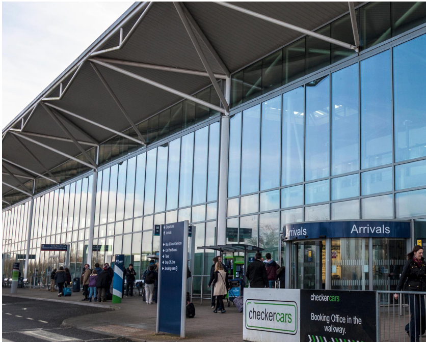
Bristol Airport BRS From Venue & primary hotel 45 mins | 49km